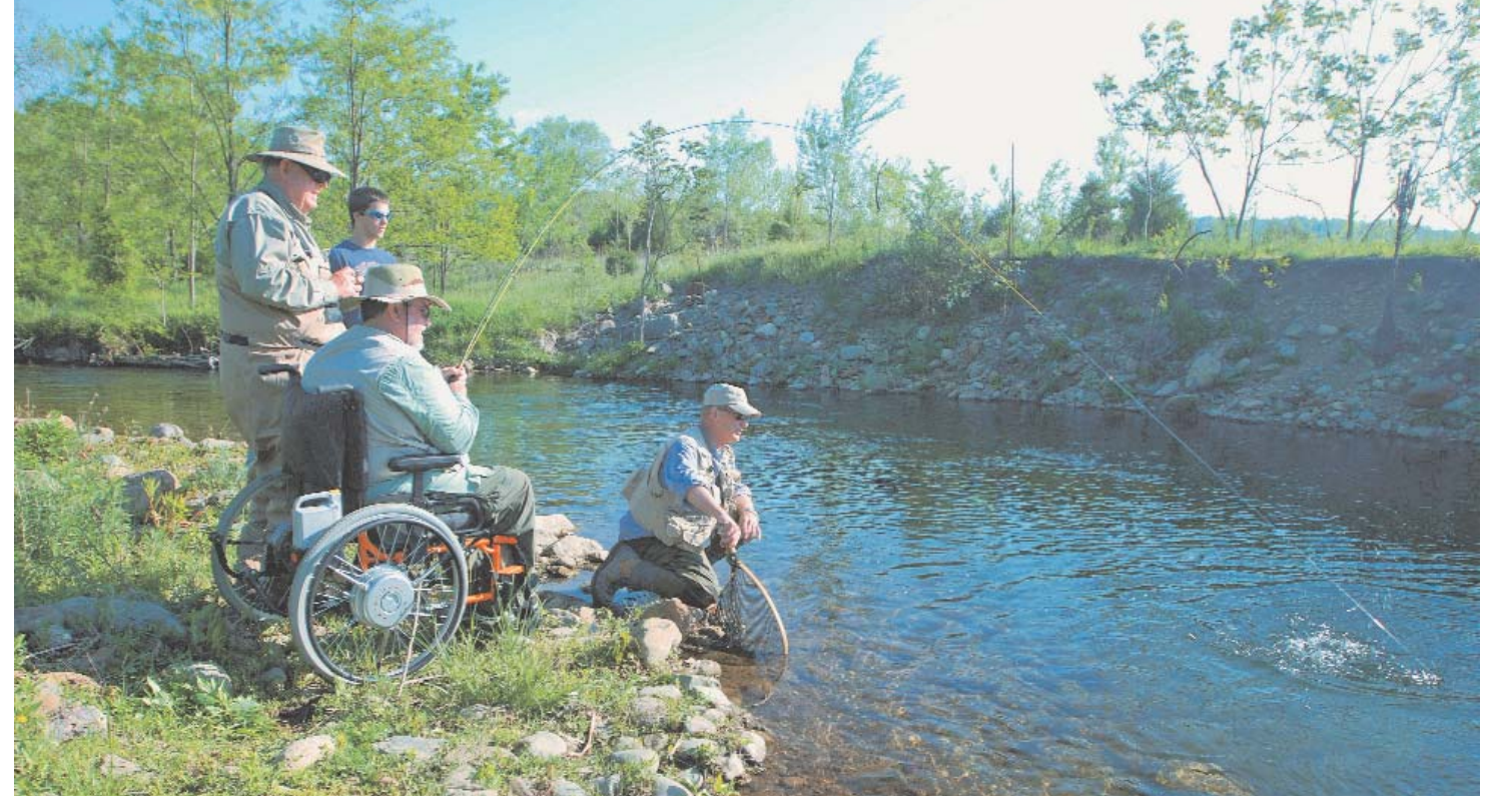
Wheelchairs are not a deterrent to fly fishing. These vets prove where there is a will, there is a way.

fly-fishing legends such as Lefty Kreh and Joe Humphreys teaching fly casting and water reading techniques. PHW brings in injured active-duty military and disabled veterans from Walter Reed Army Medical Center and VA hospitals around the country to fish and relax in the Blue Ridge Mountains."